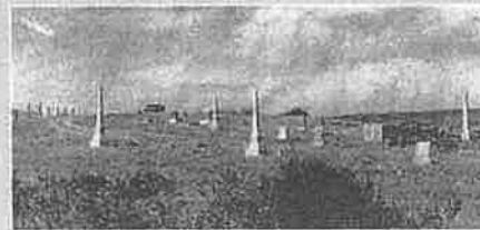
Temecula Public Cemetery District - 1928

Temecula Cemetery District is the recipient of the District of Distinction and District of Transparency awards. Presented to the District for their knowledge in Governance by the California Special District Association (CSDA).